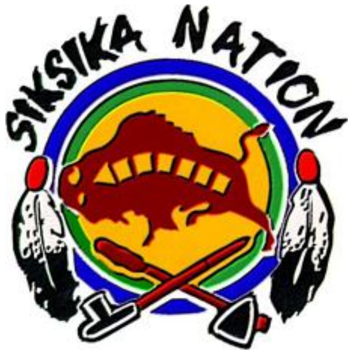
Siksika Nation (Blackfoot)